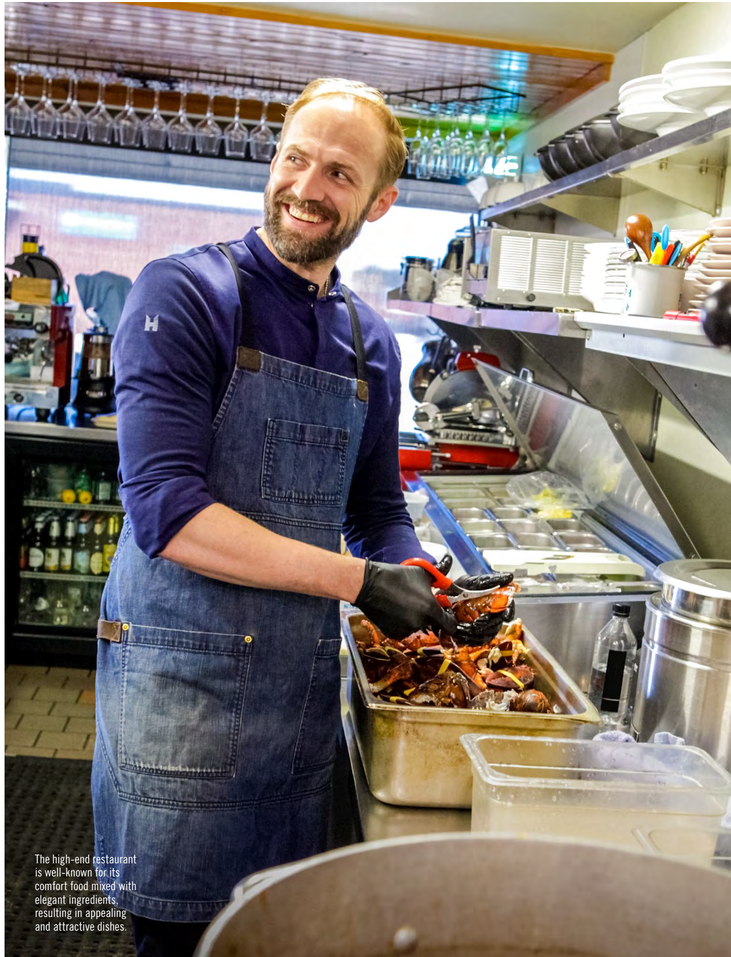
The high-end restaurant is well-known for its comfort food mixed with elegant ingredients, resulting in appealing and attractive dishes.