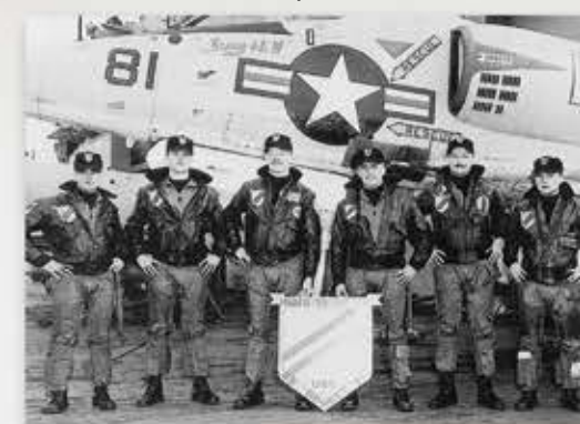
A-4C Skyhawk Pilots