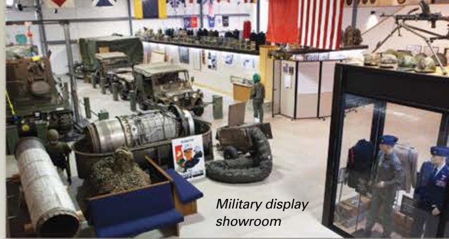
Military display showroom